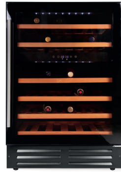
60cm integrated wine cooler