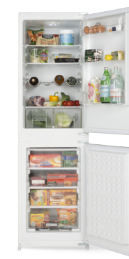
Built-in 50/50 static combi