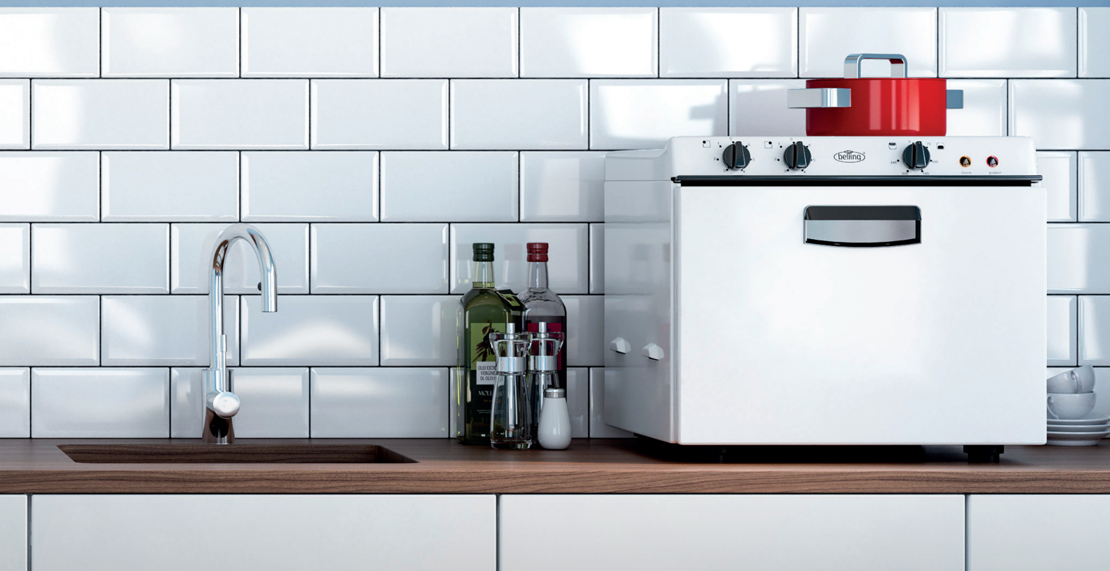
TABLE TOP COOKING, MICROWAVES & COOLING