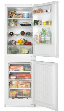
Built in frost free 50/50 combi