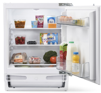
133 litre capacity built-in undercounter larder fridge