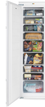
228 litre capacity built in tall freezer