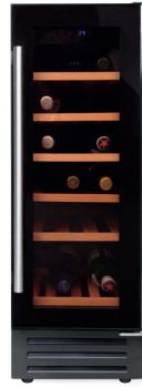
30cm integrated wine cooler