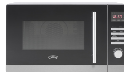
28 litre 900W combi microwave