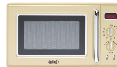
20 litre 800W retro microwave