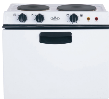
Table top conventional electric oven, fixed grill and sealed plate hob