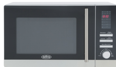
20 litre 800W solo microwave