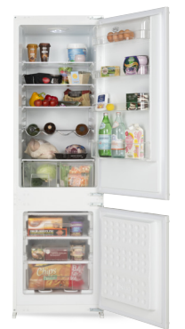
Built-in 70/30 static combi