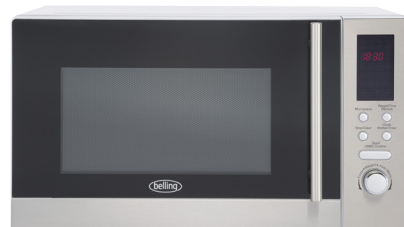
23 litre 800W solo microwave