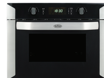
45cm integrated microwave oven and grill