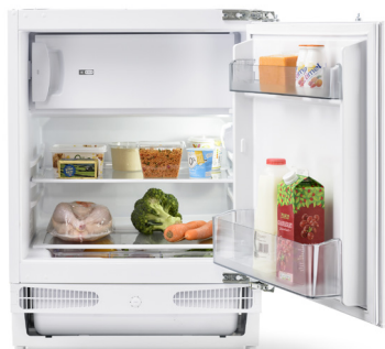
115 litre capacity built-in undercounter refrigerator