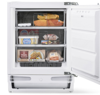
93 litre capacity built-in undercounter freezer