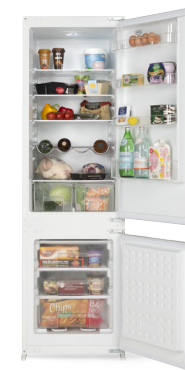
Built-in frost-free 70/30 combi