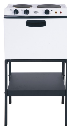
Stand for your Baby Belling cooker