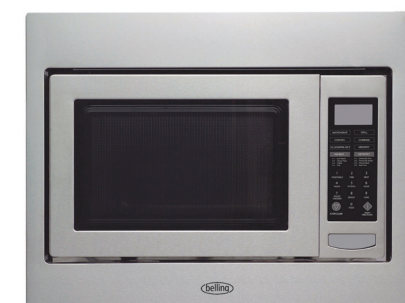
45cm integrated combination microwave oven and grill