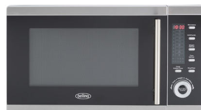
25 litre 900W microwave and grill